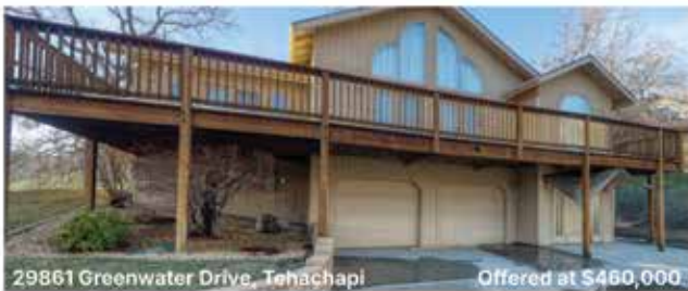
29861 Greenwater Drive, Tehachapi Offered at $460,000