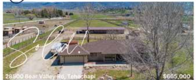
28500 Bear Valley Rd, Tehachapi $665,000

This 2,377 sq ft custom home is perfectly perched on 1.04 gorgeous acres, dotted with Oak Trees, and surrounded by majestic foothills and natural beauty. New deck installed in the rear of the home, providing opportunities to relax with a cup of coffee or a glass of wine, and just breathe it all in. Abundant wildlife visits add to the experience of quiet serenity and the awe of connecting with nature. Attention to detail and design, coupled with high-quality materials are all part of what makes this home so special. This is a one-of-a-kind home located on one of the most sought-after streets in Bear Valley Springs!